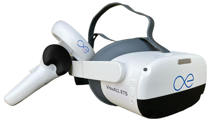
Figure 1. The VisuALL ETS.

The VisuALL has multiple testing applications in addition to visual field assessments, including visual acuity, contrast sensitivity, colour vision, pupillometry and extraocular motility. The device connects wirelessly to a Bluetooth-enabled 'clicker' and computer, with the option to upload visual fields to the patient's electronic medical record as a PDF file. Patients can wear their own glasses – patching is not required – and instructions are delivered via video in the patient's preferred language.